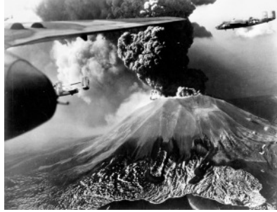
(Vesuvius erupting March 17th 1944)

During the night Vesuvius had erupted, but unfortunately it was too far away for us to see anything of the volcano.